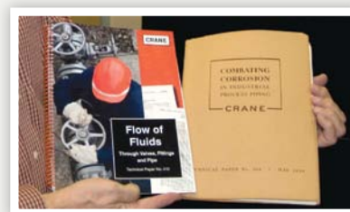
Crane TP-410 Current & the original 1942 books

XOMOX® offer customers complete and innovative product portfolio designed for the most demanding corrosive, erosive, and high purity applications. Among the industries served are the chemical processing, biotechnology, pharmaceutical, oil & gas, refining, and power generation.