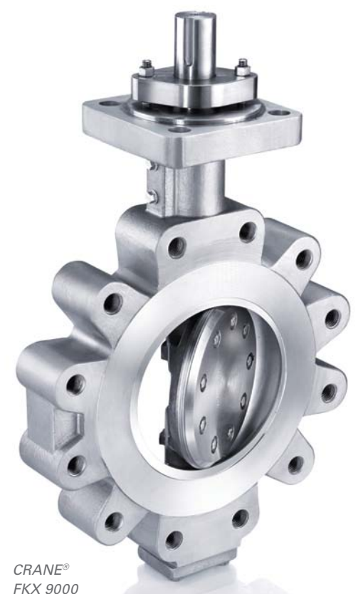
CRANE® FXK 9000